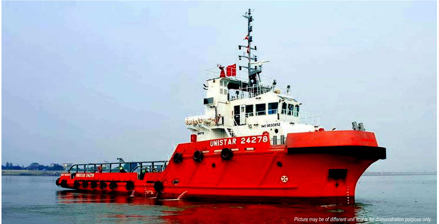
Picture may be of different unit and is for demonstration purpose only.