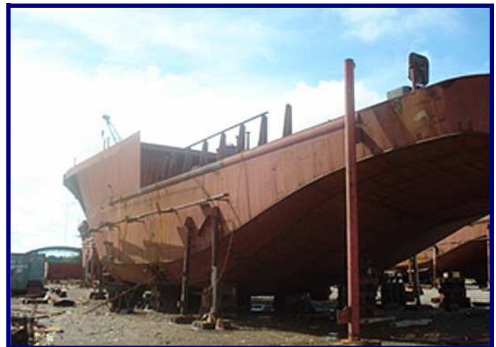
Picture of sistership updated on 13.11.08