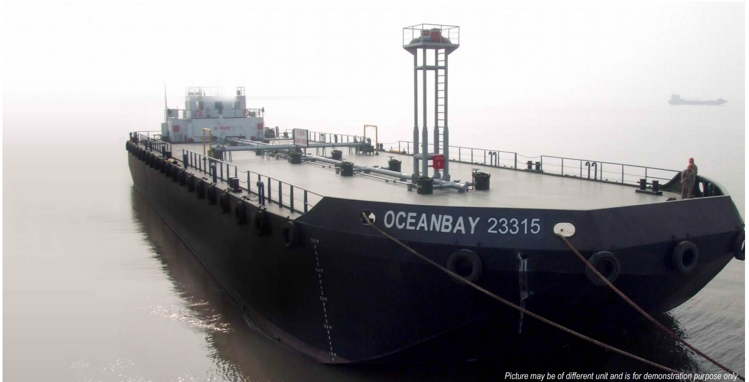
Picture may be of different unit and is for demonstration purpose only.

230FT x 60FT x 18FT Oil Barge – ± 3277.5MT